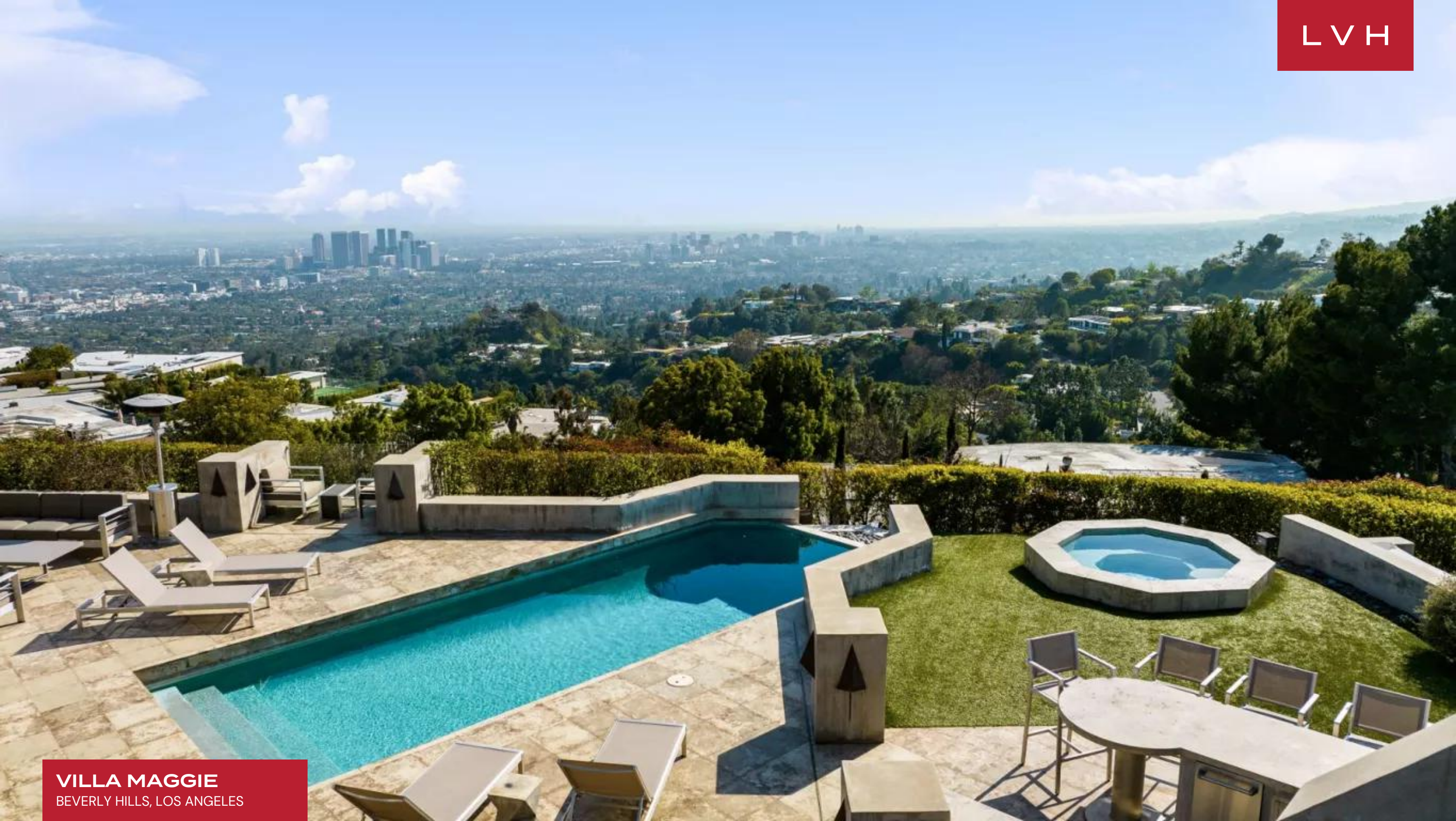
VILLA MAGGIE BEVERLY HILLS, LOS ANGELES